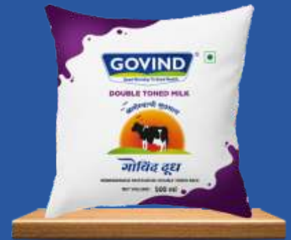
Double Toned Milk